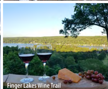
Finger Lakes Wine Trail