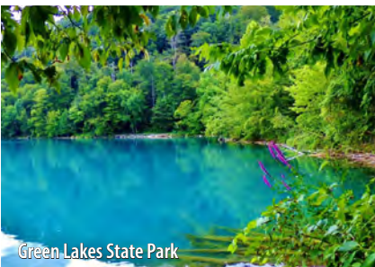
Green Lakes State Park