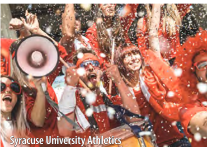
Syracuse University Athletics