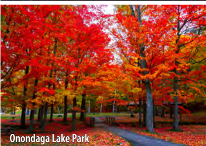
Onondaga Lake Park