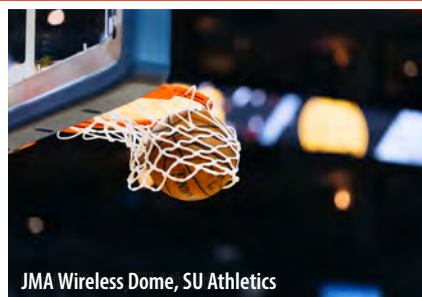
JMA Wireless Dome, SU Athletics