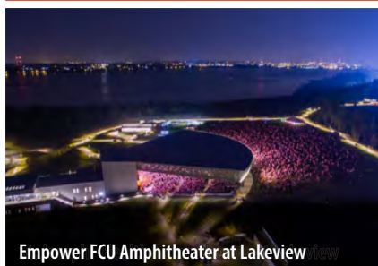
Empower FCU Amphitheater at Lakeview