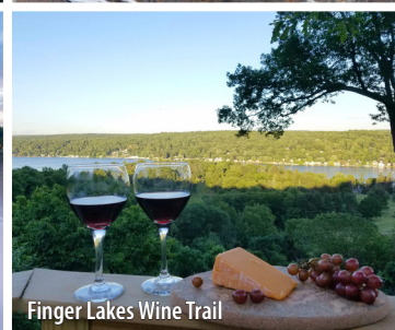
Finger Lakes Wine Trail