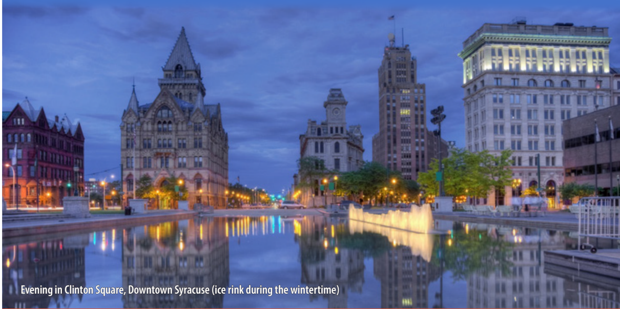
Evening in Clinton Square, Downtown Syracuse (ice rink during the wintertime)