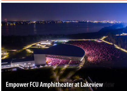
Empower FCU Amphitheater at Lakeview