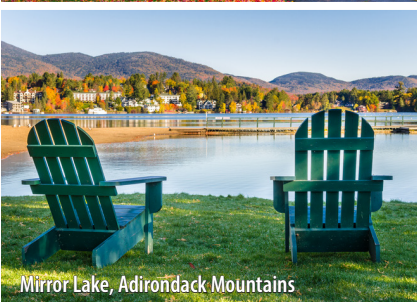
Mirror Lake, Adirondack Mountains