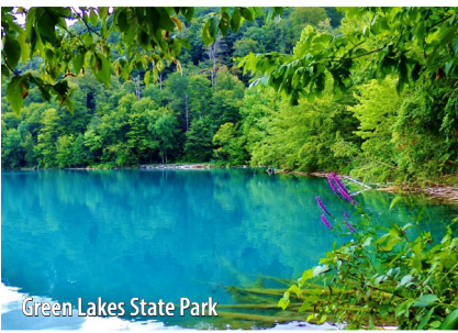
Green Lakes State Park