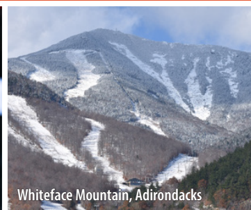
Whiteface Mountain, Adirondacks