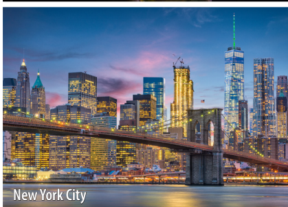
New York City