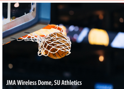
JMA Wireless Dome, SU Athletics