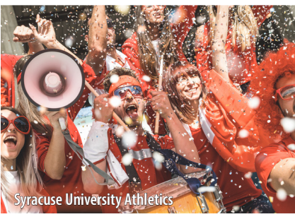
Syracuse University Athletics