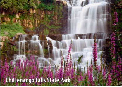
Chittenango Falls State Park

From tech, the arts, cultural events, and beautiful natural surroundings to sports and seasonal outdoor activities, Onondaga County is a great place to live, work, play, and raise a family.