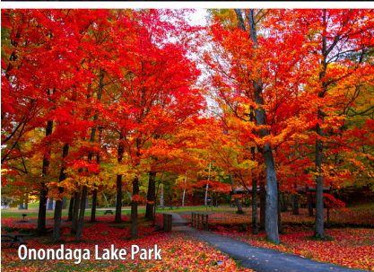
Onondaga Lake Park